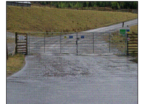
TYPICAL WIND FARM DOUBLE ACCESS GATE