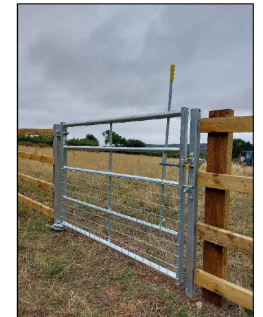
TYPICAL NON-VEHICULAR ACCESS GATE WITH BRIDLEWAY PROVISION